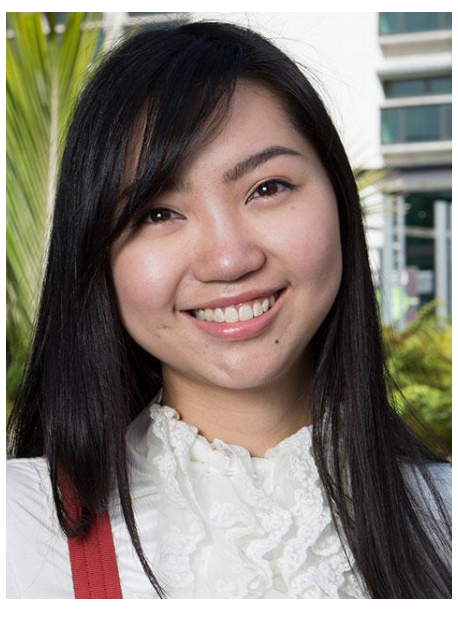
'I want air pollution caused by power generation to be an issue for the past...'

Structural Engineer Technician, Spanbild NZ Ltd